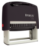
Personalized DC Self-Inking Jurat Stamp