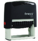
YOUR NAME HERE NOTARY PUBLIC DISTRICT OF COLUMBIA My Commission Expires March 31, 2025