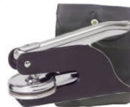
Embossing Seal and Case