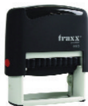
YOUR NAME HERE NOTARY PUBLIC DISTRICT OF COLUMBIA My Commission Expires March 31, 2025