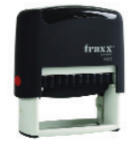
YOUR NAME HERE NOTARY PUBLIC DISTRICT OF COLUMBIA My Commission Expires March 31, 2025